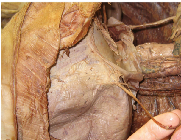
c Cranial view of phrenic nerve bundle