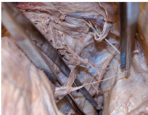
a Splanchnic nerve bundles